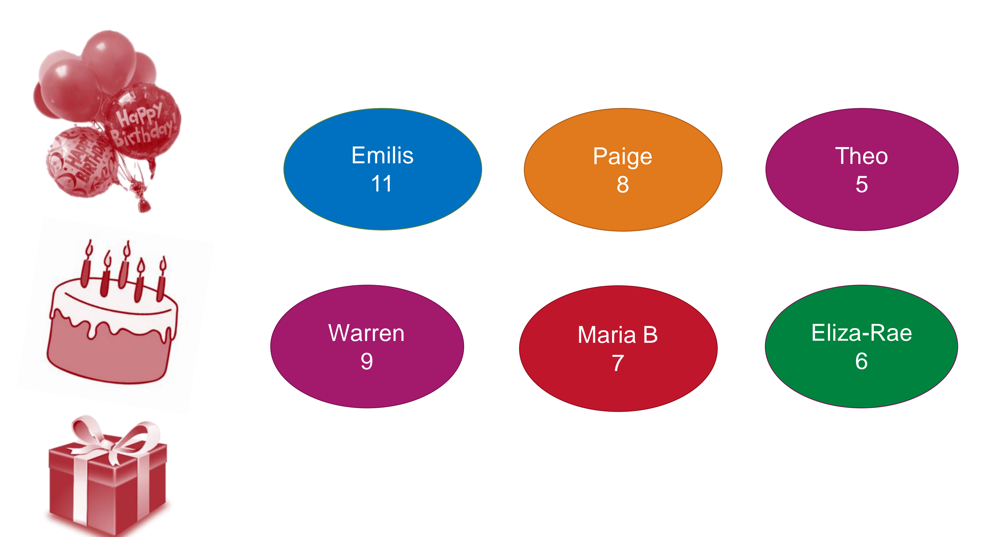
Happy Birthday from everyone at Ravensthorpe!